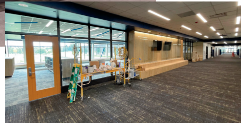
Photo of hallway outside media center, July 2024

More about all of the Bond Projects at GLcomets.net/Bonds