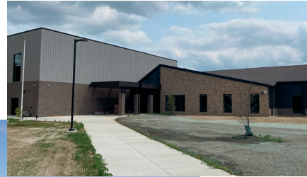
Photo of the new Wacousta Elementary, July 2024