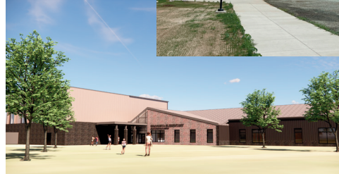
Architectural design rendering of the new Wacousta Elementary main office entrance