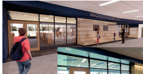
Architectural design rendering of hallway outside media center between academic classroom wings