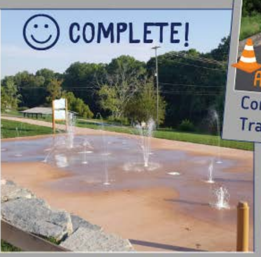
Universally Accessible Splashpad