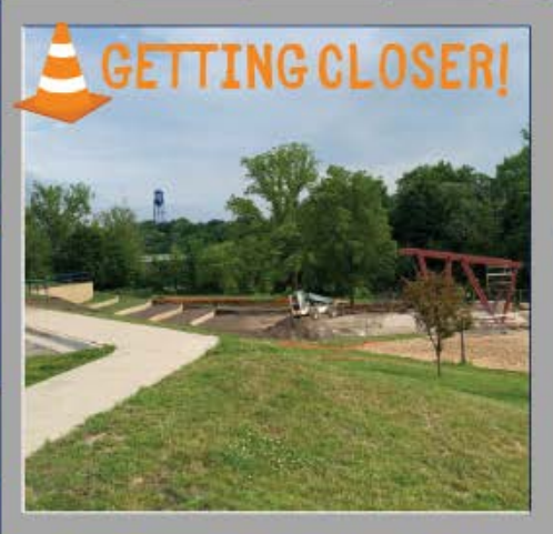
Performance Shelter Venue

For many months of patiently enduring the construction at Jaycee Park, we thank you! We hope you will take pride in the tremendous improvements #NaturallyGrand that are now (finally) ready