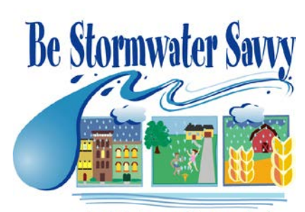
Don't let a good drop go bad!

Please note that after the school year is completed and during the months when school is not in regular session (summer), those parents who requested advance notice by mail, will be notified using an alternative method consisting of a telephone message notification system. The school will also continue posting advance notification at the school by the methods identified above.